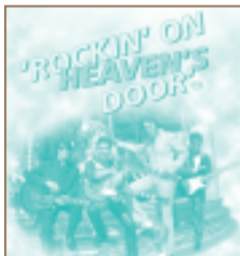
Rockin on Heavens Door Friday 8 September