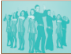
The Magical Dance of Ireland Friday 19 May