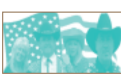
Country Legends Thursday 24 August