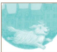
Greyfriars Bobby Saturday 3 June