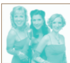
The Swingcats Thursday 28 September