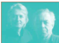
Phil Cunningham & Aly Bain Thursday 17 August