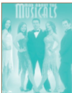
Mad About the Musicals Saturday 24 June