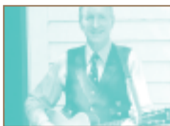
George Hamilton IV Thursday 25 May